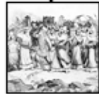
The Walls of Jericho Fall Approx. 1406 BC