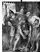
Achan's Sin and Death Approx. 1406 BC

Here is the picture to add to your timeline.